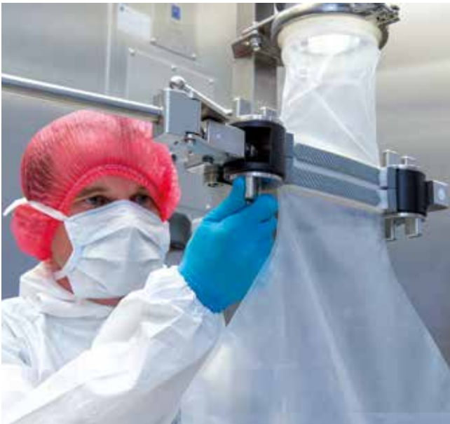
For visibly contained product transfer and the safe handling of potent products, the disposable Hicoflex® system is quick and easy to install and use