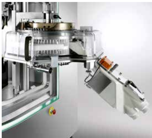
The MODUL™ Q rotary tablet press

In addition, constant dwell times while varying the machine speed can be used to match the production capacity of the line without influencing tablet quality. Other unique features ensure a constant flow and equal distribution of powder that are without equal, as well as integrated data collection and analysis, and advanced process control.