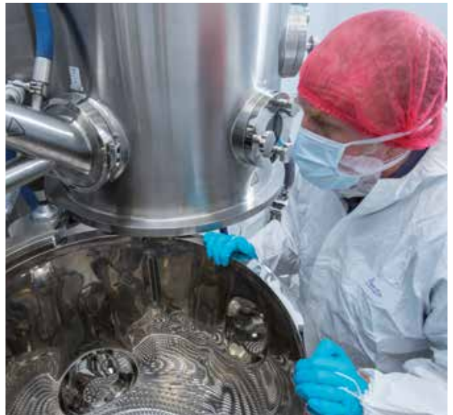
GEA can supply an entire, completely integrated containment system, from raw material to coated tablet