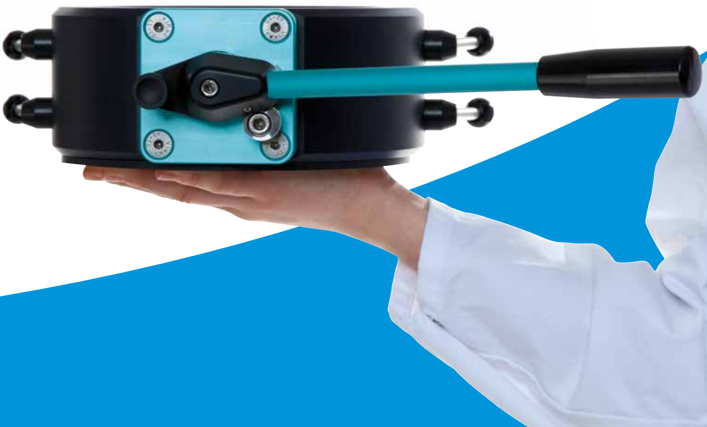
The BUCK® MC Lite is the lightest split butterfly valve for the contained transfer of highly potent solid dosage products