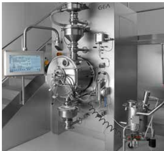
The ConsiGma® coater

With a smaller technical space requirement than established technologies, less cleaning and a reduced plant area is needed. And, being a continuous production technology, no scale-up is required and the maximum batch size is almost infinite.