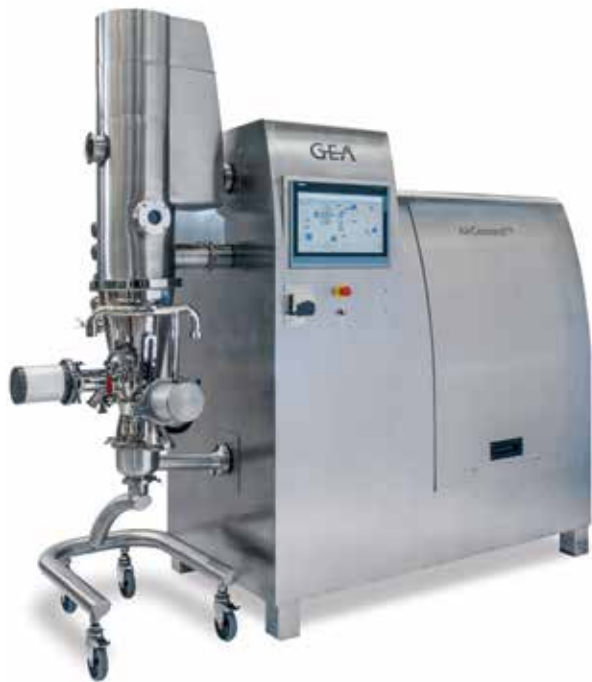
AirConnect® for flexible small-scale processing